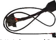
OBDII Adapter (Optional)